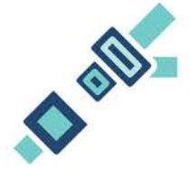
Seat Belt Injury