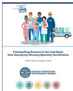
5 Compelling Reasons to Get (and Keep) Your Emergency Nursing Specialty Certification

Sustaining Specialty Excellence is the fifth installment of BCEN's white paper series, available for free download: