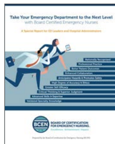
Take Your Emergency Department to the Next Level: A Special Report for ED Leaders and Hospital Administrators