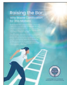
Raising the Bar: Why Board Certification for RNs Matters